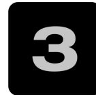
3 years OSRAM guarantee, refer to www.osram.com guarantee for precise conditions

No disturbing flickering in the headlamp